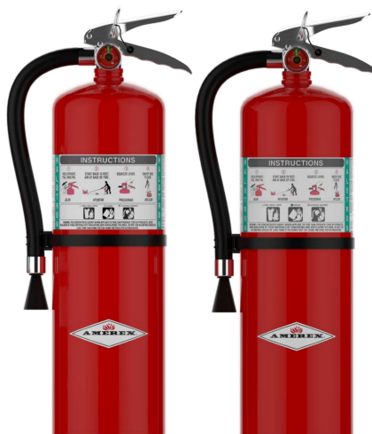
397 P/N 15509