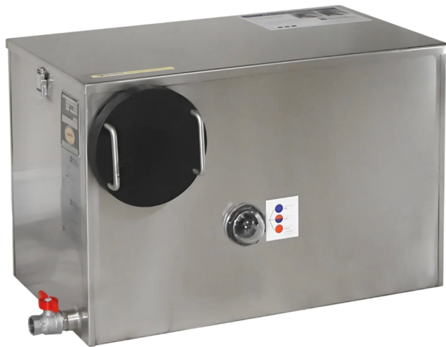
Grease Guardian GGXM-35B

The bacterial digesting treatment is a non-toxic, agent which helps digest fats oils and grease while eliminating odors in the kitchen wastewater.