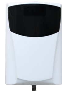
Wall Mounted Automatic Biological Dispenser

Bio Refills are required for the GGXM Bio Grease Traps, available in a 3 month pack or a 12 month pack. Each refill lasts one month.