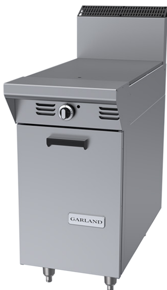
Model M6S Shown with Optional Backguard