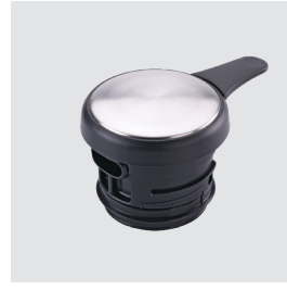
Flow Control Regular Black FCCLBLK