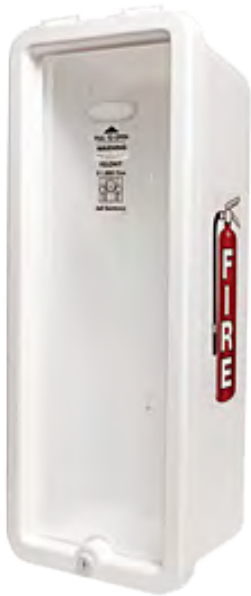
Island Chief 105-5 WWC-P

Cato's affordable fire extinguisher series, manufactured in the U.S, provides a dent and rust proof alternative to metal. Cato's Island Chief series fire extinguisher cabinets feature a security hexagonal lock and key to open and remove the trim and pull panel cover. The acrylic features a hand opening to easily pull panel out to gain access in case of fire.