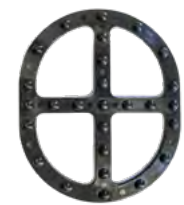
Fire Extinguisher Tray Accessory