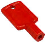
10006R Red Hex Key