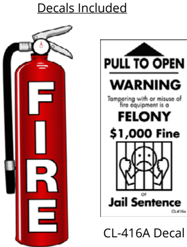
CL-401 Decal available with red or white background