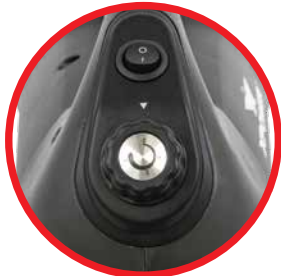
Droplet Size / Flow Rate Adjustment