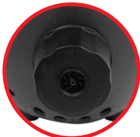
2 Flow Rate Nozzles included in F-8 Models