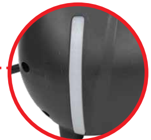
Reservoir Level Window to Monitor Liquid Levels