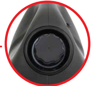
Easy Fill Reservoir