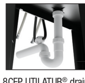
8CFP UTILATUB® drain