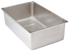
SP-A - Spillage Pan

Visit our website for additional Food Table Accessories