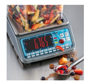
ClearShield™Protective Cover allows for easy clean up