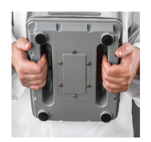
Built in carrying handles for secure transport