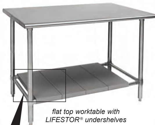
flat top worktable with LIFESTOR® undershelves

Eagle LIFESTOR® undershelf for Stainless Steel Worktables, suffix #-L1. 1¼"-diameter stainless steel crossrails on all sides, with LIFESTOR® solid polymer removable shelf sections.