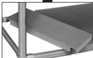
undershelf made of removable shelf sections