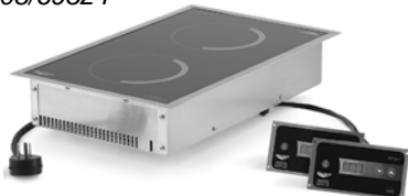
Induction Ranges: Intrigue™ Heavy-Duty Ultra and Professional Series Drop-In