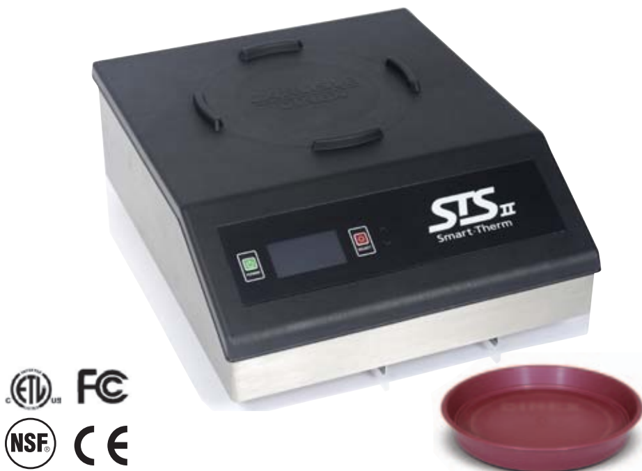
DX821 series INDUCTION BASE