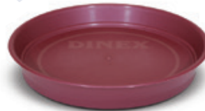
DX821 series INDUCTION BASE