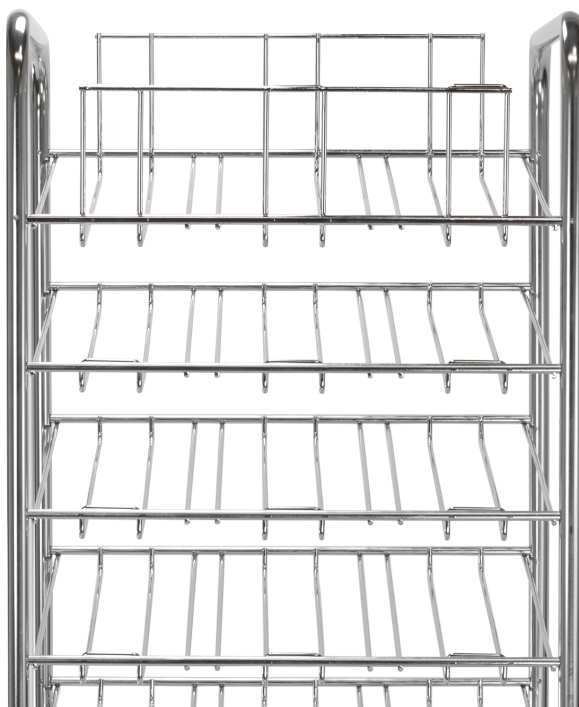
DC96 Dough Cart

Loading and unloading is fast, easy and practically automatic with the gravity flow. The chutes are sequentially feeding, first-in, first-out.