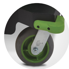
Specialized casters make cart movements smooth and easy

All PC Series Mobile Powered Workstations listed below come standard with (one) adjustable height shelf, 6" locking casters, push handles, integrated power system and power strip, waste basket and holder.