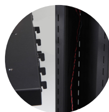
Slotted support mast for adjustable shelves