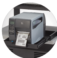
Optional printer shelf