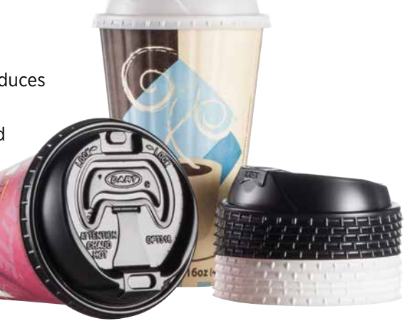
Image enhancer — Upscale your coffee program with the Optima® reclosable lid paired with a Solo® paper hot cup! No other cup/lid combination offers this type of security, outstanding quality and uniqueness

Beverage protector — the Drink Well Plug serves as a protective shield to prevent contamination of the sip hole and the beverage inside the cup, alleviating sanitation concerns