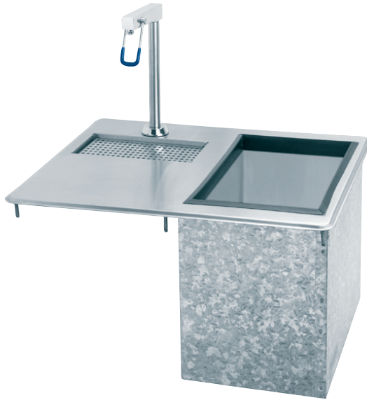
D-24-WSIBL 21" x 18"