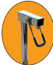
Units Include K-54 Filler Faucet

D-12: Replacement sliding stainless steel cover