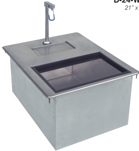
D-24-WSIBL2 18" x 21"

Item #: _____ Qty #: _____ Model #: _____ Project #: _____