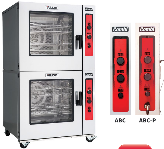
Model ABC7E Shown stacked