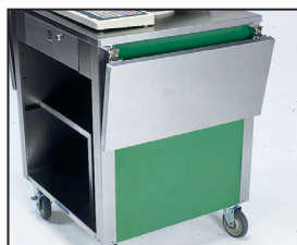
Fold-down tray slides