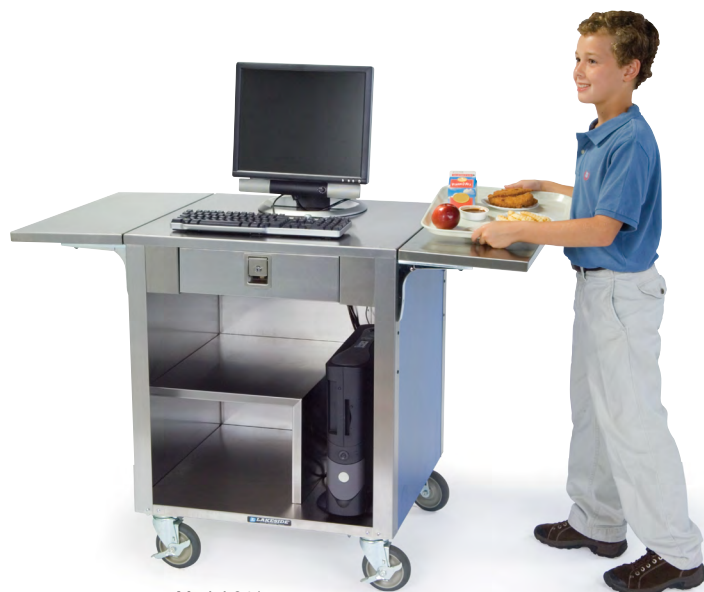
Model 641 Shown with optional locking cash drawer