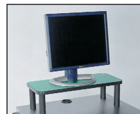
Optional monitor shelf