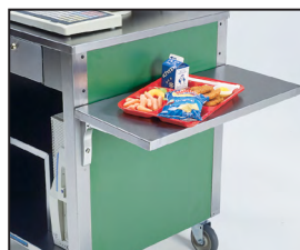
Height-adjustable tray slides