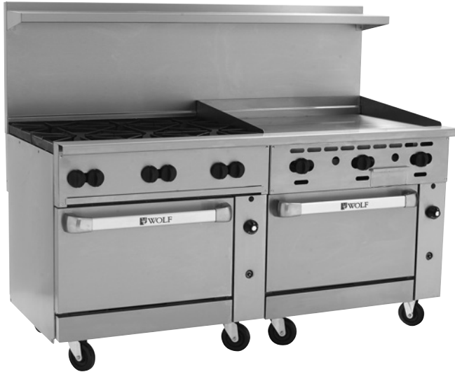
Model C72SC-6B36GN (shown with optional casters)