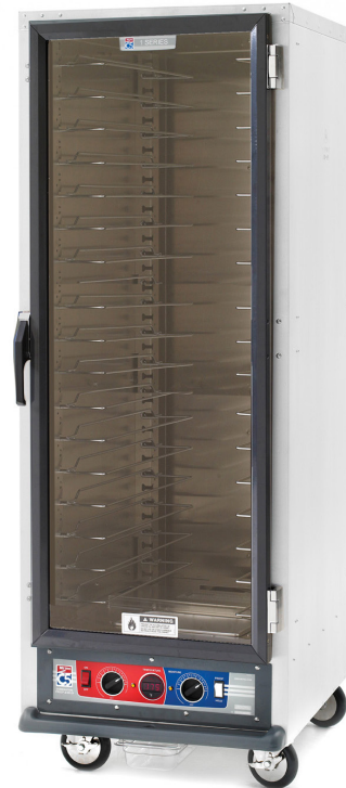
Full Height Fixed Slides Combination Module