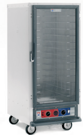
3/4 Height Fixed Slides Combination Module