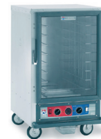
1/2 Height Fixed Slides Combination Module