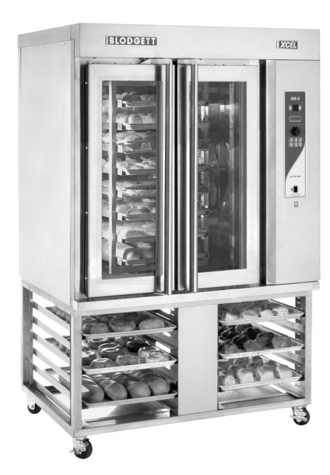
XR8-G with 12 pan stand