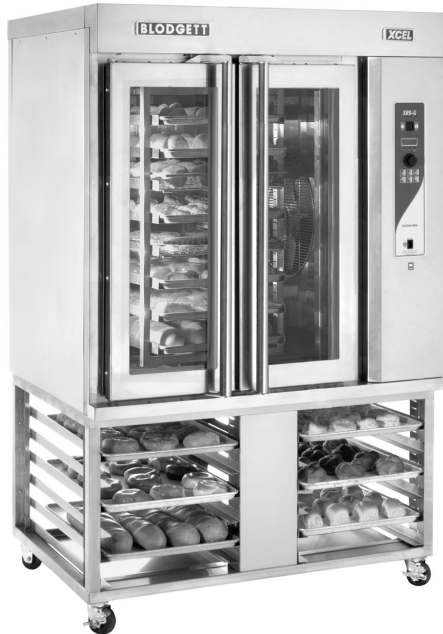
XR8-E with 12 pan stand