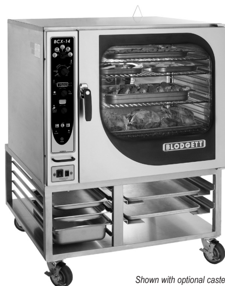
Shown with optional casters