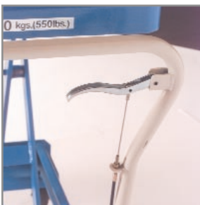
Convenient Hand-Lever Lowering Control For Model BX