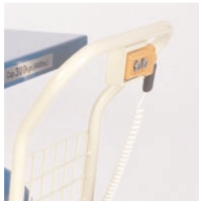
Removable Pendant Push-Button Control in Handle Mount (BXB)