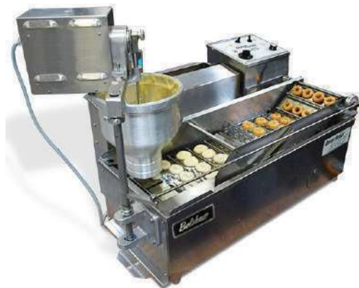
Donut Robot® Mark II Gas with Mini Donuts