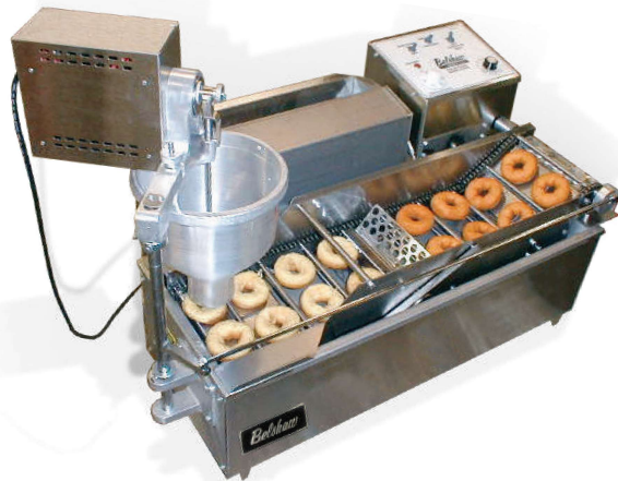
Donut Robot® Mark II Gas with Donuts