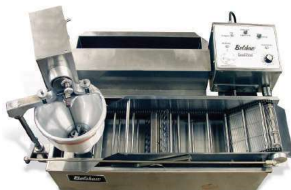
Donut Robot® Mark ii GP Gas (mini donuts only)