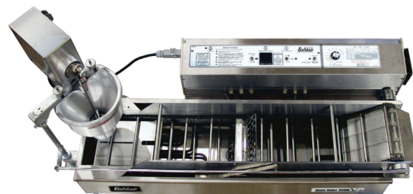
Donut Robot® Mark V - Mark V GP