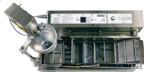
Donut Robot® Mark II - Mark II GP