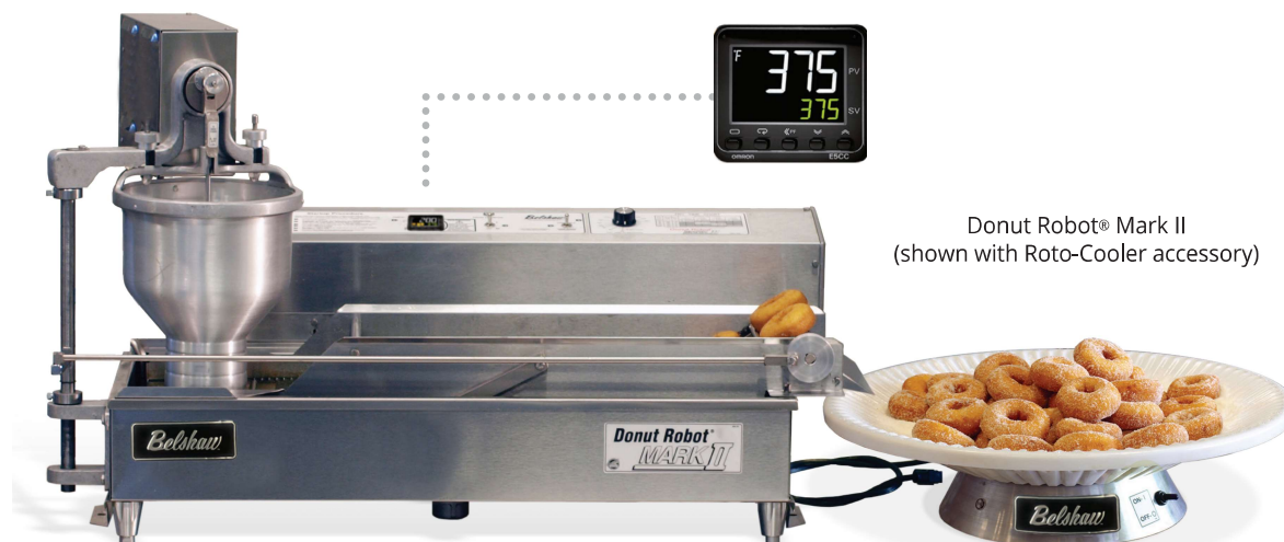
Donut Robot® Mark II (shown with Roto-Cooler accessory)

Belshaw's Donut Robot® fryers are highly versatile and can produce Cake Donuts, Mini Donuts, Ball Donuts (Donut Holes) and Raised Donuts. Training and labor requirements are minimal to produce a high quality, consistent product.