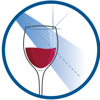
Ultra clear & sparkling