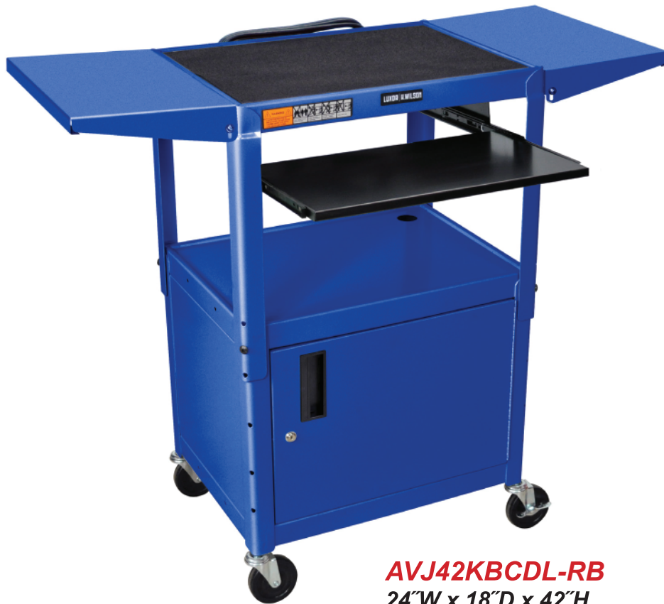
AVJ42KBCDL-RB 24"W x 18"D x 42"H