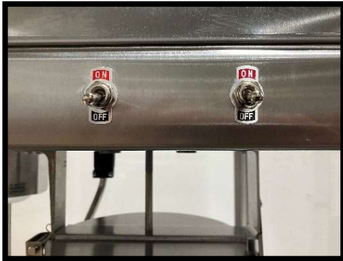
Click on/off kettle, heat, stir, light controls