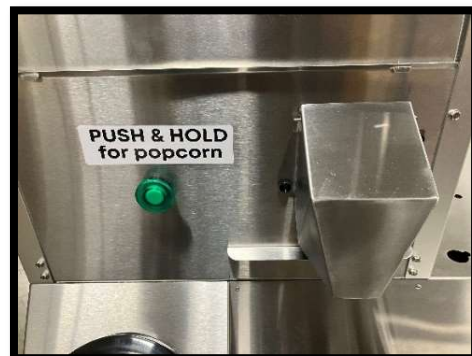
Easy to use push button self-service dispensing