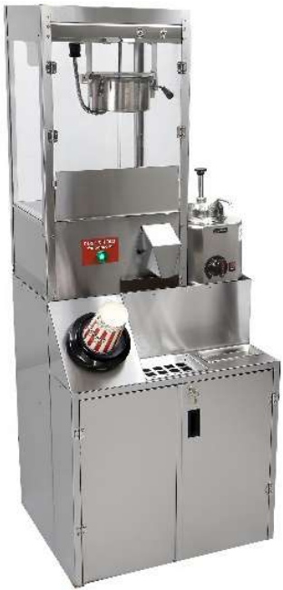
Auto Serve 8 Ounce Popcorn Machine shown sitting on top the Auto Serve Stand (sold separately)