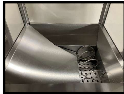
Innovative, self-service dispensing technology