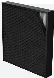
Fellowes Code: 9436902