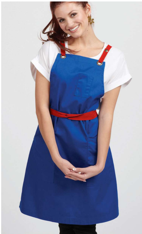
9043 3-Pocket Bib Apron