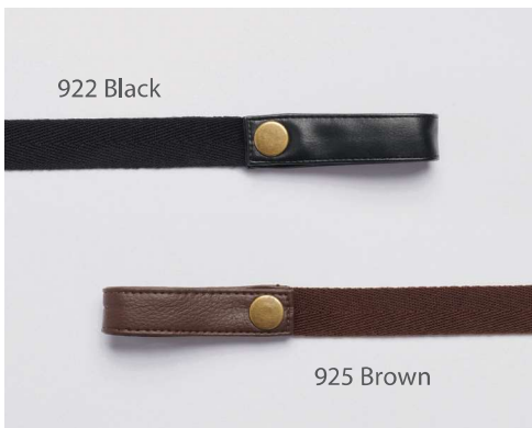
9091 Faux Leather Apron Straps (2-pack)