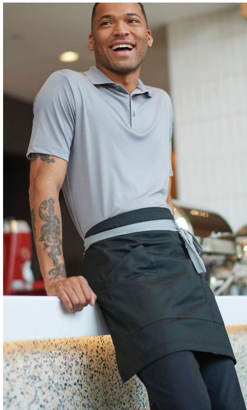
9041 3-Pocket Waist Apron