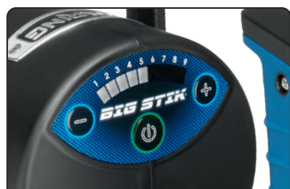
Electronic speed adjustment with LED indicator