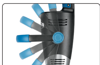
Patented pivoting second handle and comfort grip