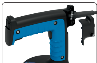
Dual-trigger handle and serviceable cord design