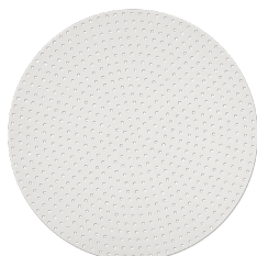
Silicone Anti-Scorch Pad