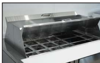
Dual Sided Lids

This product is equipped with a fine mesh filter to the front of the condenser to catch dust, and a rotating brush that moves up and down daily to remove excess buildup outward and away.