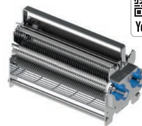
96-blade tenderizer cradle optional