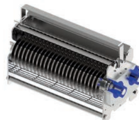
48-blade 3/8" (10MM) 32-blade 5/8" (15MM) Strip Cutter Fajita cradle optional