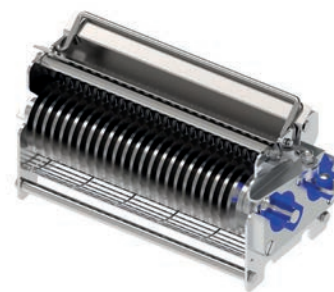
32-blade 5/8" (15MM) Strip Cutter Fajita cradle optional