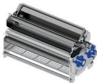
96-blade tenderizer cradle optional

Certified to UL Standard 763 and NSF Standard 08 Certified to CSA Standard C22.2