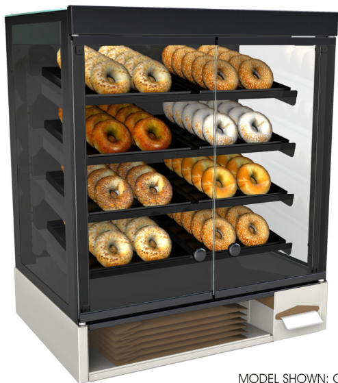
MODEL SHOWN: CSC3223

Lengths include end panels 30-7/8"L x 22-5/8"D x 36-3/8"H