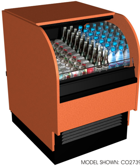
MODEL SHOWN: CO2739R

Lengths include end panels 27-1/2"L x 34-1/8"D x 39-3/8"H