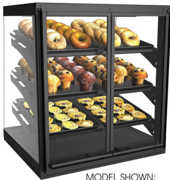
MODEL SHOWN: CGS2830 SELF-SERVICE