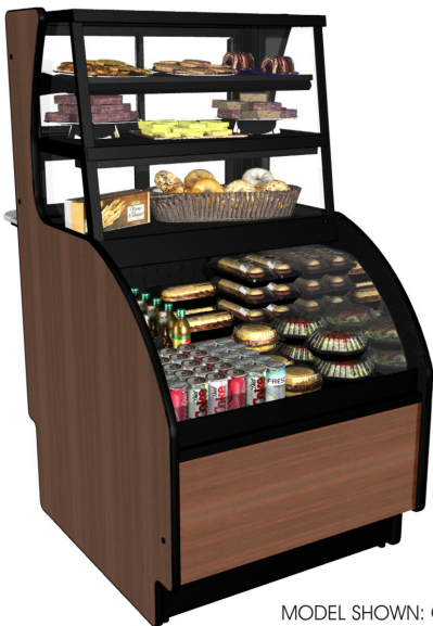
MODEL SHOWN: C3Z3667

Lengths include end panels 36"L x 41-7/8"D x 67-1/2"H 48"L x 41-7/8"D x 67-1/2"H