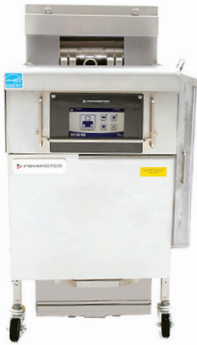
Model Shown: 1FQE60U