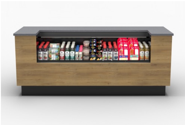
Built-in Counter example – millwork not included

Low Profile, Self-Contained, Self-Service Merchandiser