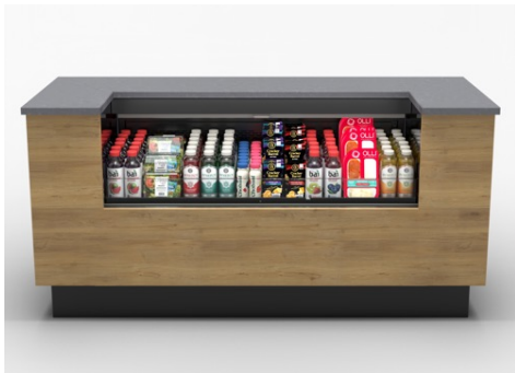
Built-in Counter example – millwork not included

Low Profile, Self-Contained, Self-Service Merchandiser