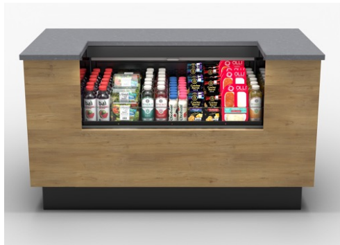
Built-in Counter example – millwork not included

Low Profile, Self-Contained, Self-Service Merchandiser