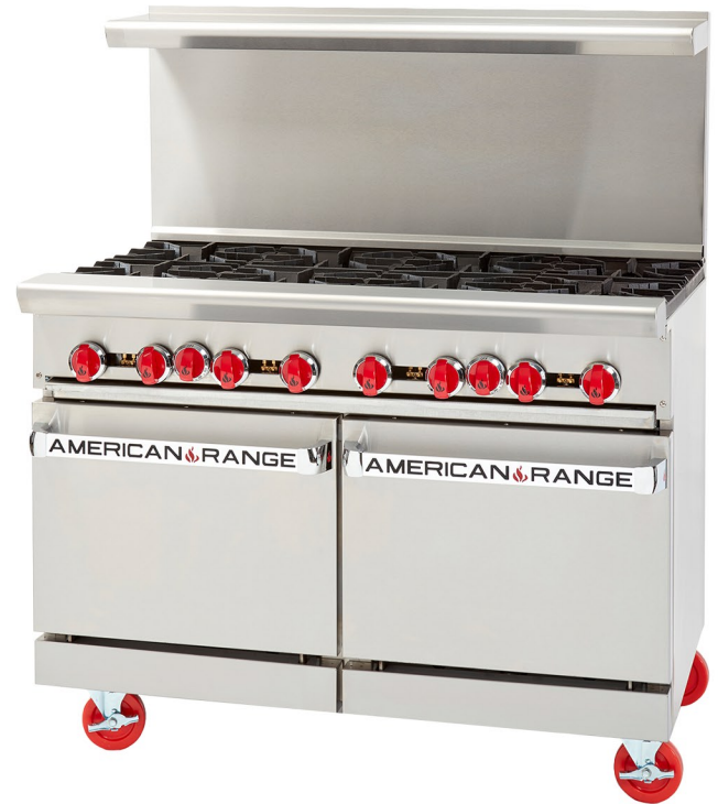
Model Shown AR-8