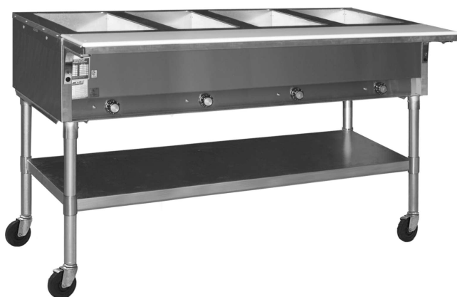
#PDHT4-120 portable hot food table

Eagle Hot Food Tables, open base design, model _____ . Top and body are heavy gauge type 430 stainless steel. Beaded top openings are 12½" x 20½". Heating compartments are 8"-deep, galvanized, and insulated on all four sides and bottom with 1" fiberglass or equal. Recessed control panel with individual infinite controls offer high and low settings. Each compartment fitted with 500-watt heating element for 120-volt units, and 750-watt heating element for 208- and 240-volt units. 6' cord and plug extends from the bottom right hand side of the unit. Furnished with polycarbonate cutting board. Legs are 1½" O.D. tubing, with adjustable undershelf and 4"-diameter casters.