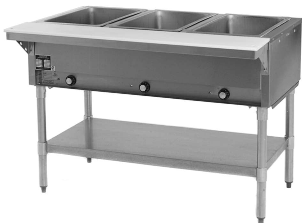
#DHT3-120 hot food table

Eagle Hot Food Tables, open base design, model _____ . Top and body are heavy gauge type 430 stainless steel. Beaded top openings are 12 \frac{1}{2} " x 20 \frac{1}{2} ". Heating compartments are 8"-deep, galvanized, and insulated on all four sides and bottom with 1" fiberglass or equal. Recessed control panel, with individual infinite controls, offer high and low settings. Each compartment fitted with 500-watt heating element for 120-volt units, and 750-watt heating element for 208- and 240-volt units. 6' cord and plug extends from the bottom right hand side of the unit. Furnish with polycarbonate cutting board. Legs are 1 \frac{1}{2} " O.D. tubing, with adjustable undershelf and adjustable bullet feet.