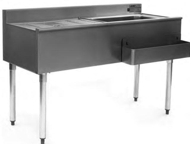
#CWS4-18R cocktail workstation

Eagle 1800 Series Cocktail Workstation with Sealed-In Cold Plate, model _____. Top, front, backsplash, and ice bin to be heavy gauge type 304 stainless steel. Fabricated ice bin is 8" deep, fully insulated, with sealed-in 7-circuit cold plate and 1½" drain. 1½" O.D. galvanized tubular legs with adjustable bullet feet.