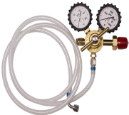
KIT, PRIMARY N2 REGULATOR